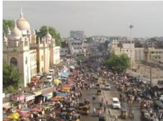
Hyderabad from Char Minar