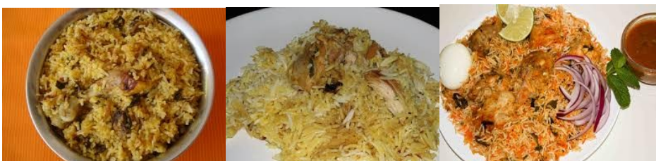
Dum Biryani is an Indian chicken and Basmati rice recipe that is cooked on Dum over slow heat.

The Conference is being held at Hyderabad a 450 years old city, known in modern times as city of medical tourism. Hyderabad is known worldwide for Pearls, Bridal Bangles & Dum Biryani.